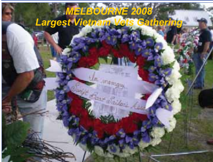
MELBOURNE 2008 Largest Vietnam Vets Gathering

The SBSA presently has 645 paid-up members!